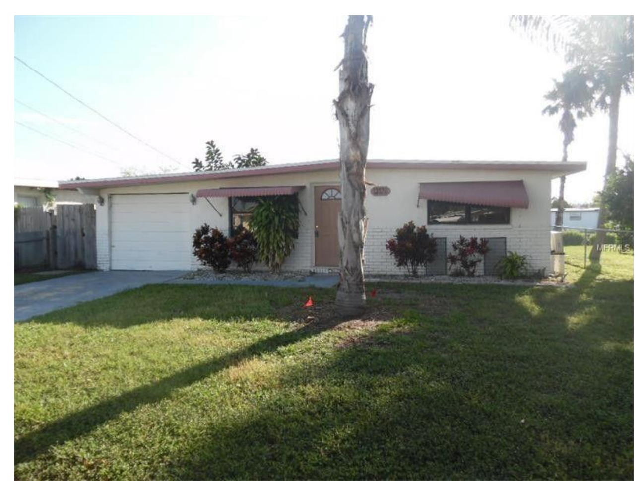
View from street