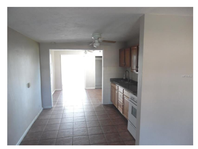
View through front window