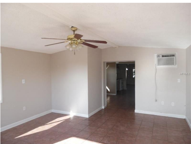
View through rear door